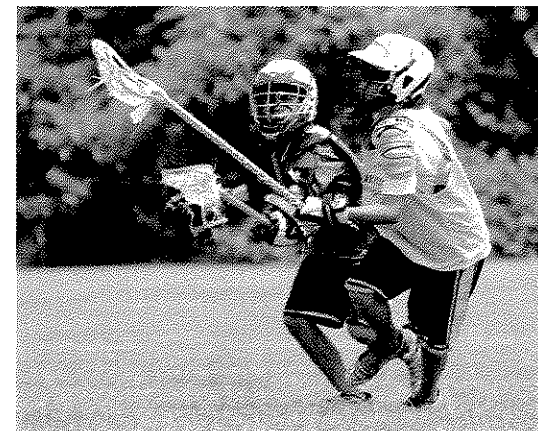
I had a great time; I thought that the camp was well organized and that all of the coaches really knew what they were doing.'