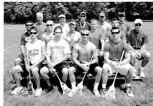
The 2008 OSLC Coaching Staff- experienced, knowledgeable, dedicated